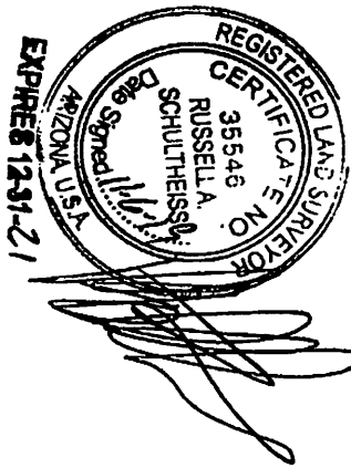
EXHIBIT "B" EASEMENT ABANDONMENT SKETCH TO ACCOMPANY LEGAL DESCRIPTIONS