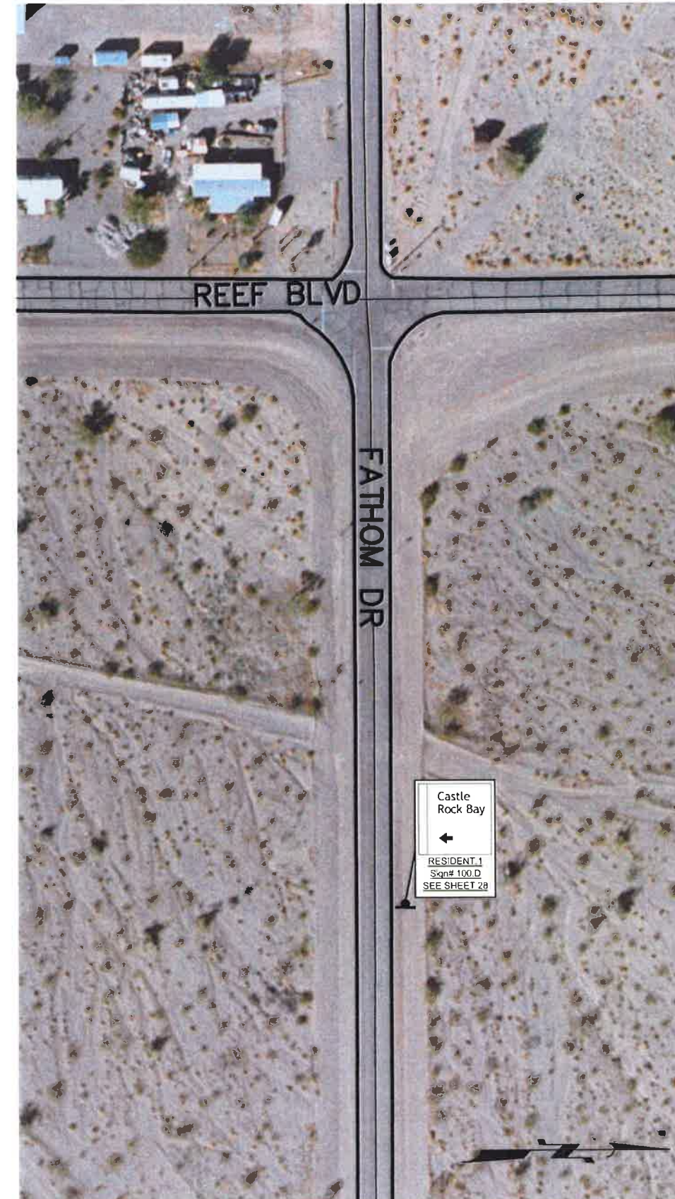
REEF BLVD & FATHOM DR