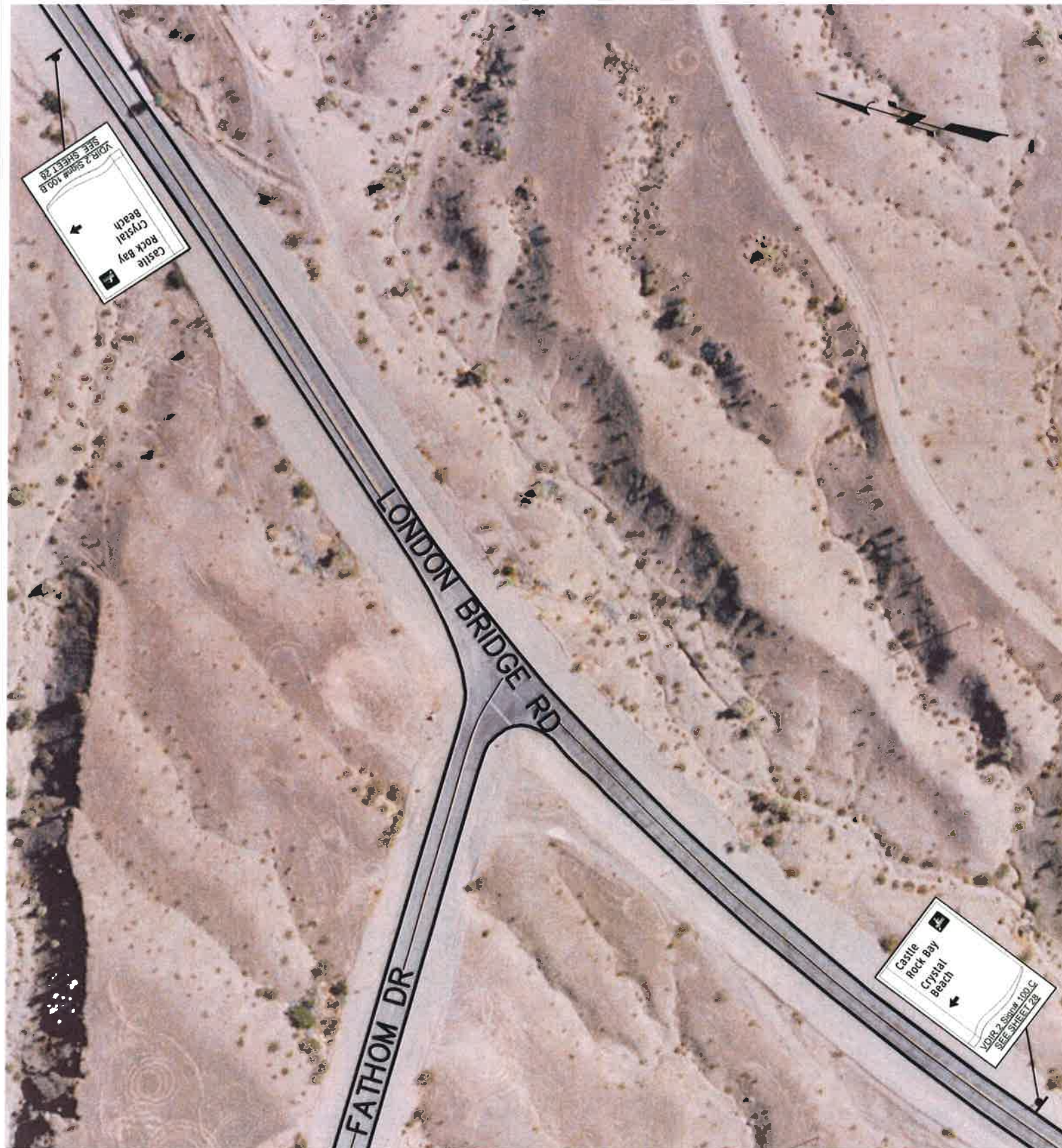
LONDON BRIDGE RD & FATHOM DR