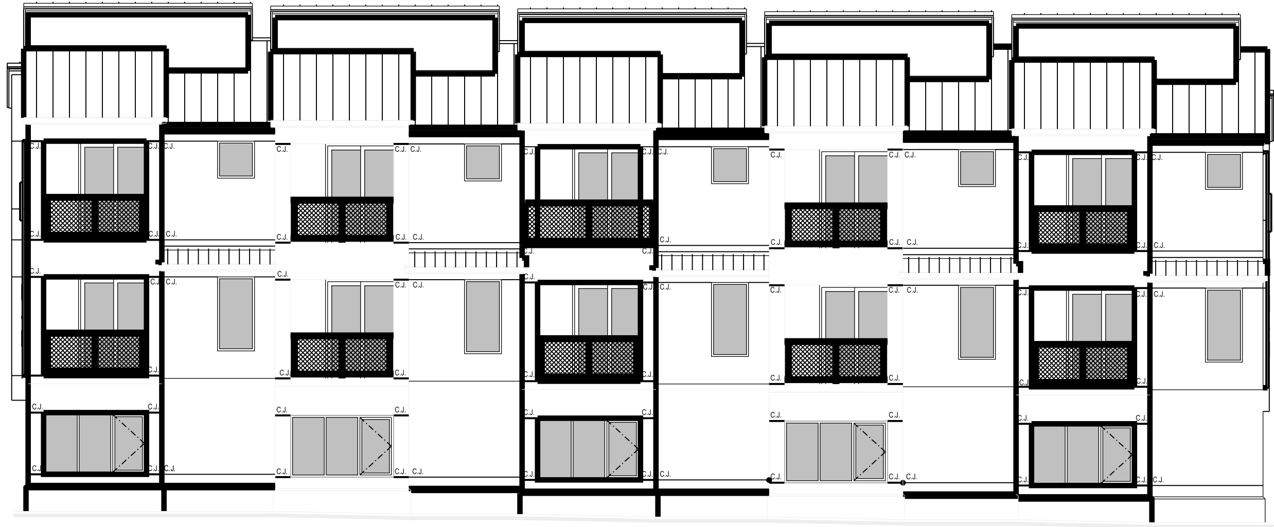
1 WEST ELEVATION 1/8" = 1'-0"