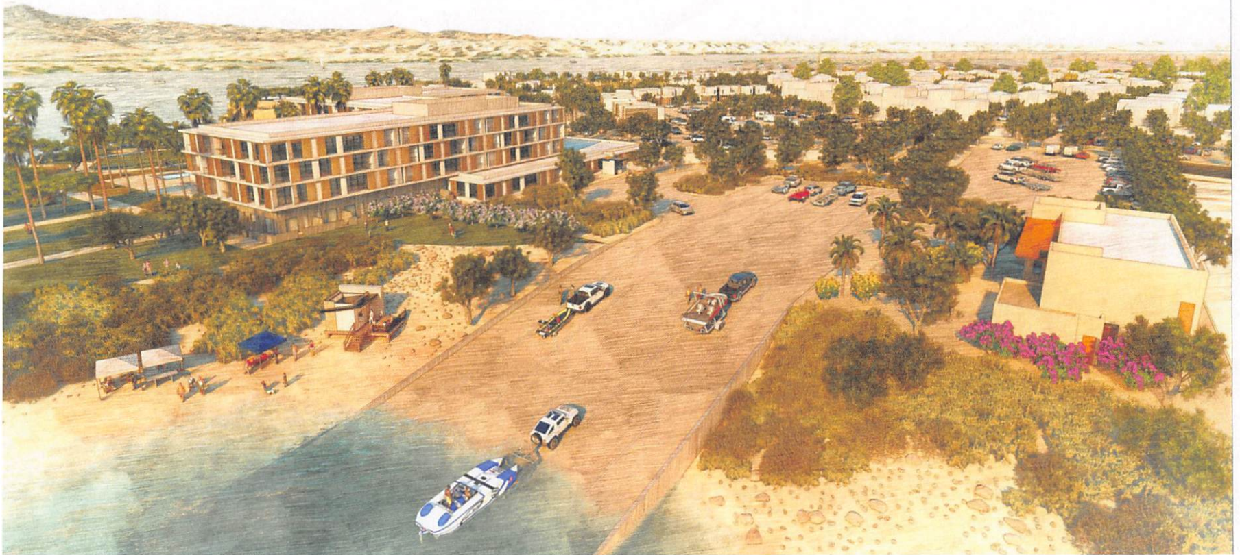
PROPOSED PUBLIC BOAT LAUNCH AND RESORT