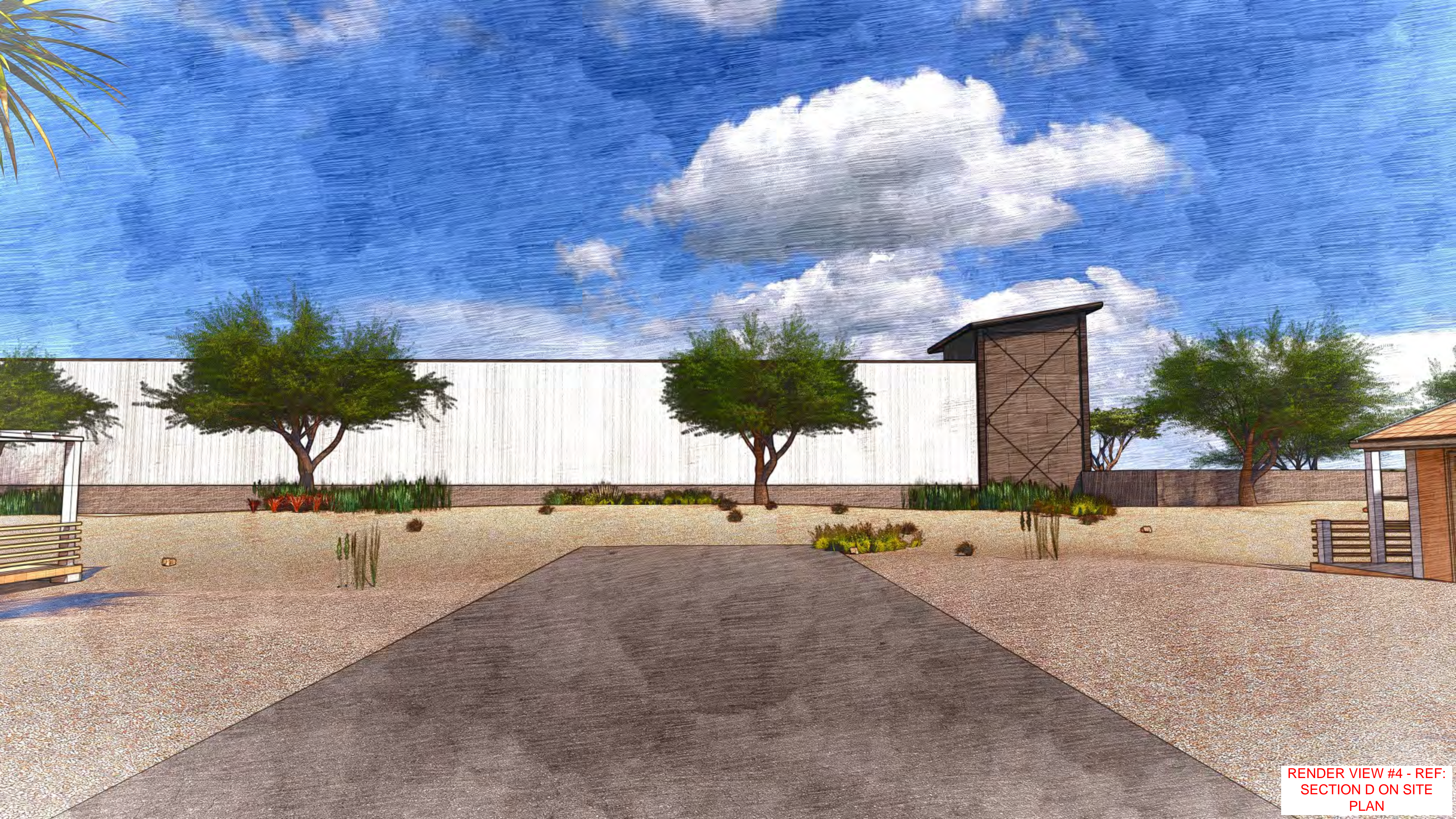
RENDER VIEW #4 - REF: SECTION D ON SITE PLAN