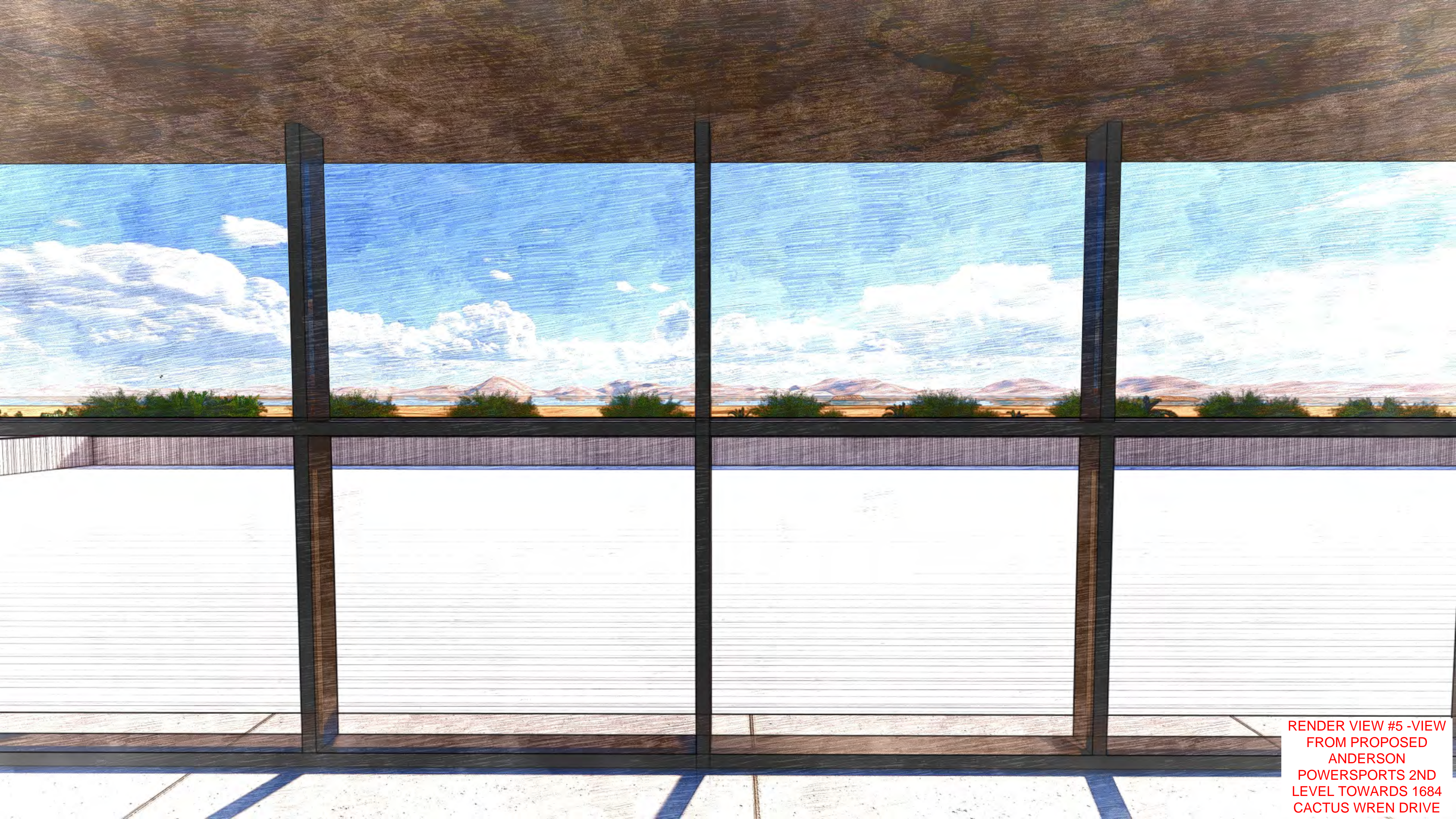
RENDER VIEW #5 -VIEW FROM PROPOSED ANDERSON POWERSPORTS 2ND LEVEL TOWARDS 1684 CACTUS WREN DRIVE