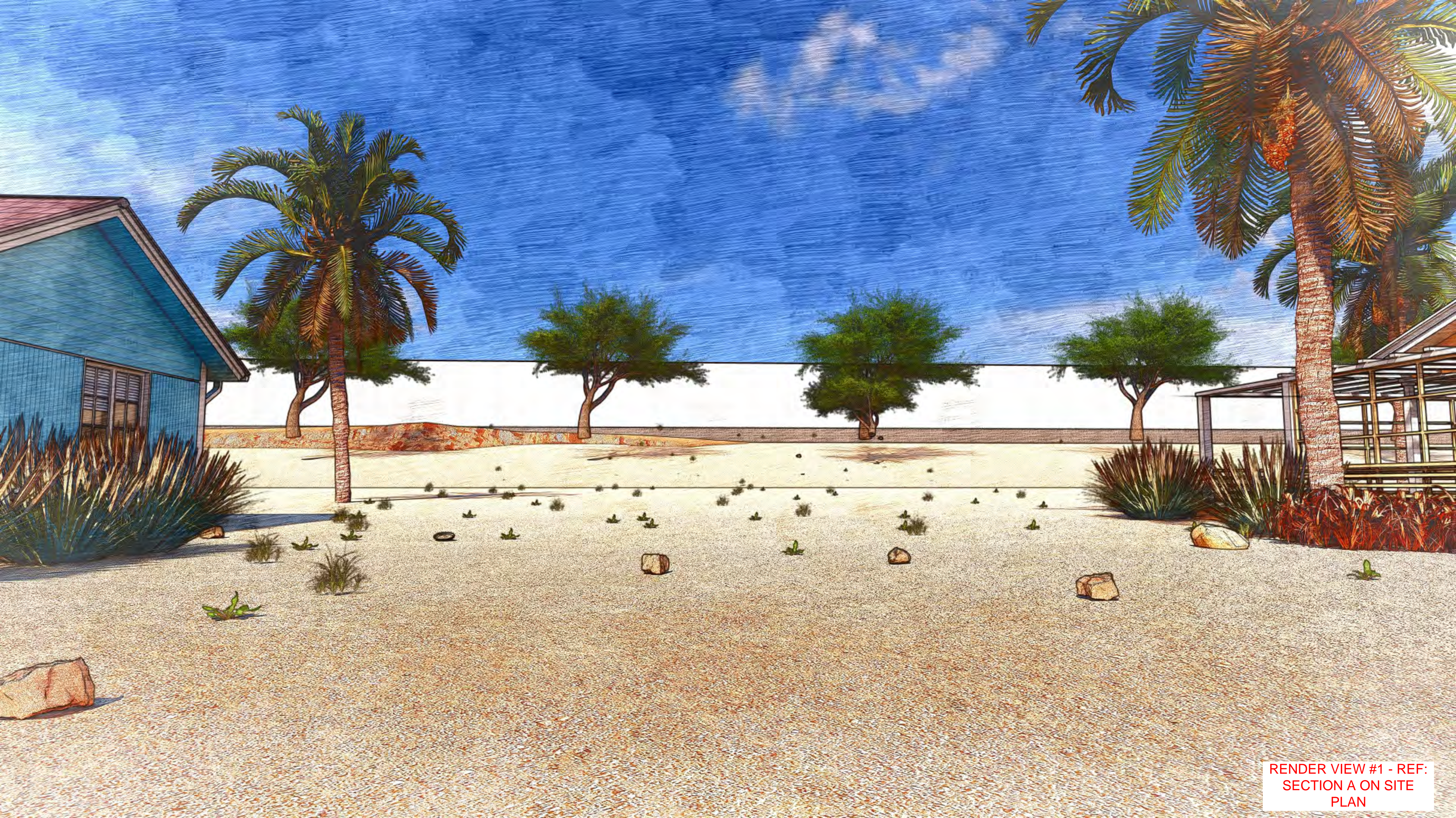
RENDER VIEW #1 - REF: SECTION A ON SITE PLAN